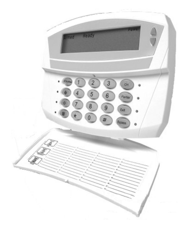
HILLS® Series Icon Code Pad